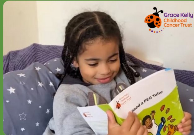
Grace Kelly Childhood Cancer Trust